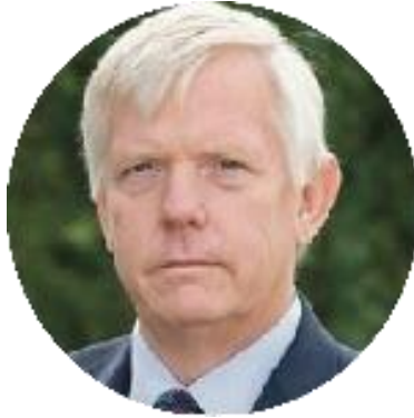
David Fothergill Leader Somerset County Council Twitter: @DJAFothergill